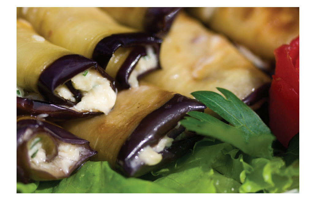
Table 1. Nutrition facts on eggplant

The benefits of eggplant do not stop with the farmers. It is also beneficial for human health because it is high in fiber and water, rich in anti-oxidants, a good source of vitamins and minerals (Table 1). Hence, this vegetable can help prevent cancer, diabetes, and gastrointestinal diseases.