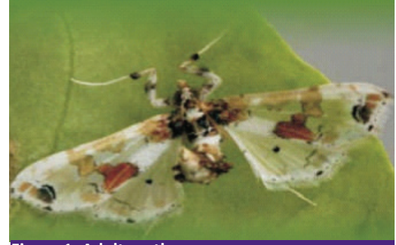
Figure 1. Adult moth

To address this problem, many eggplant farmers in major eggplant producing areas in the Philippines and Bangladesh spray chemical insecticides every other day, or up to 80 times per growing season.<sup>7,9</sup> The practice is unacceptable and unhealthy to consumers, farmers, and the environment. It is also a common practice in the Philippines to dip unharvested eggplant fruits in a mix of chemicals to ensure marketability of fruits.<sup>7</sup> In India, farmers spray insecticides 20-40 times per crop cycle or else they will have no harvest.<sup>8</sup>